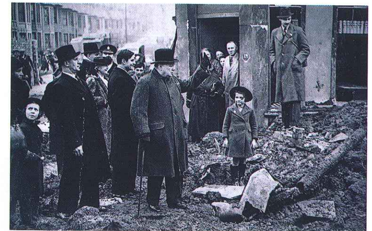
D Winston Churchill, center, inspired the British to continue fighting. During the Battle of Britain, the country withstood nightly German air raids.

C Worldwide, World War II took the lives of more people, mostly civilians, than any other war.